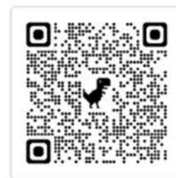
Birthday Bucket Form