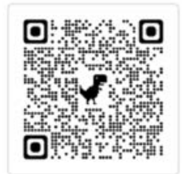
Birthday Bucket Form